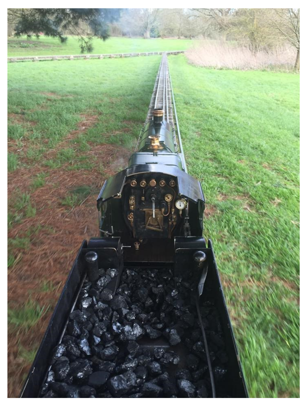
Above: Drivers eye view on Easter Weekend, the start of public running for 2016 - S Parham