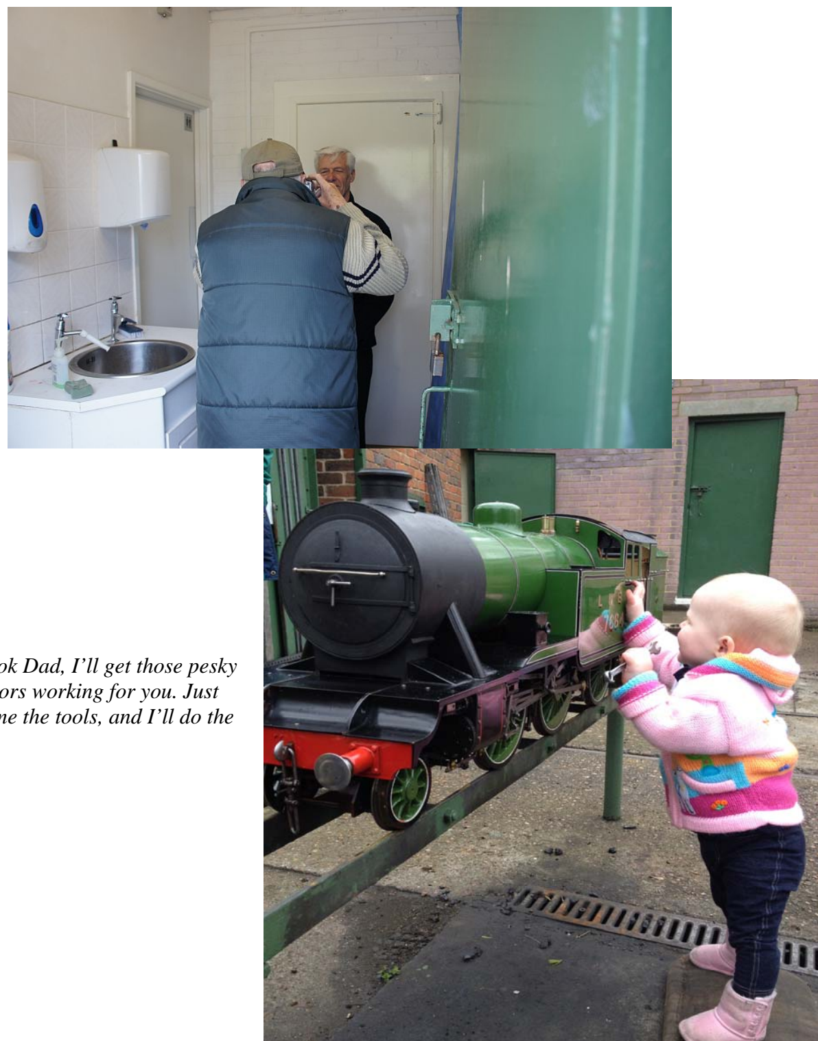
"It's ok Dad, I'll get those pesky injectors working for you. Just give me the tools, and I'll do the job"